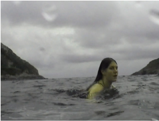
Figure 2. Image from a story scene, captured at the location where it will be screened

Scenes may arrive in a variety of sequences (with some built-in plot advancement). With this semi-linearity, there is no one fixed goal. The navigation interface can aid the user in a decision to visit one part of the island over another, given the scenes' distance apart, their distance away from her current position, and the amount of time she has to spare. The landscape of story hotspots continually changes, with new stories becoming available and others disappearing off the map. The changing availability of content depends on the weather- some scenes are meant to be viewed under a blanket of clouds, and others only in rain.