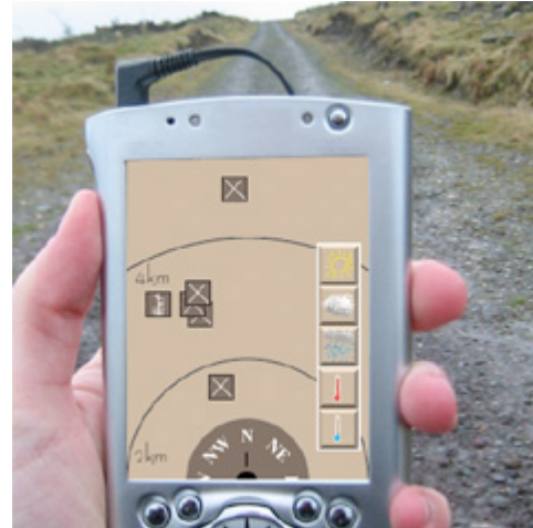
Figure 3. Early GUI design

By relying on context sensitive sensors, we have been able to reduce the amount of traditional GUI interaction and replace it with forms of interaction appropriate for the devices intended use.