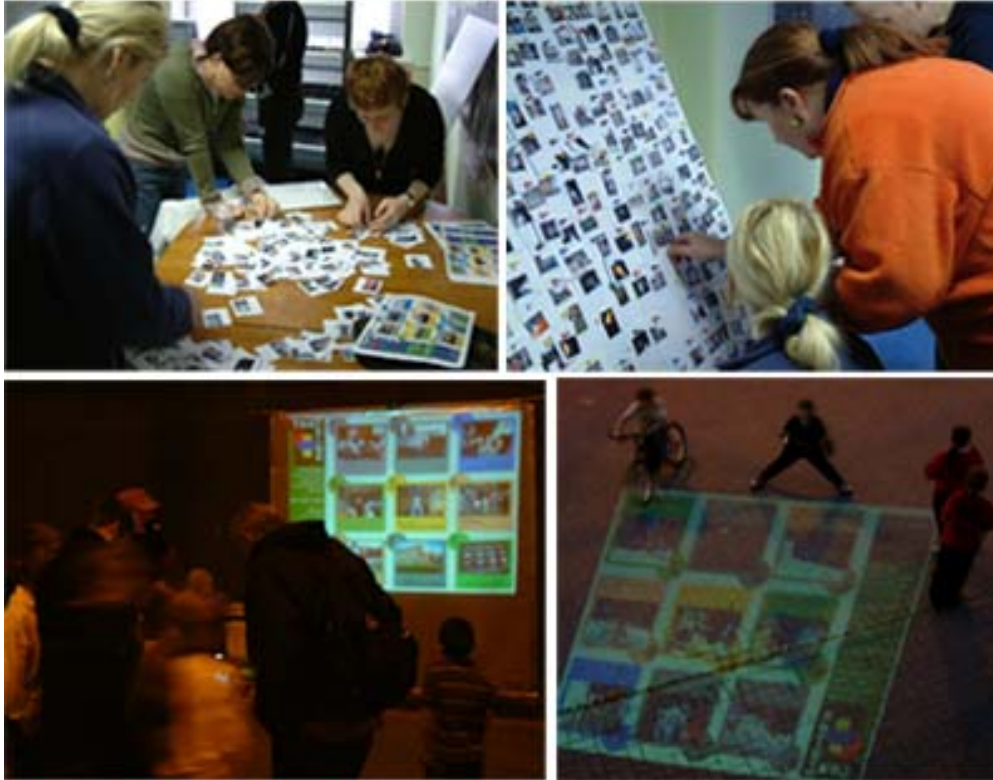
Figure 2. Top: The Fatima History Group editing images taken by Fatima residents. Bottom: Images from the installations at Fatima Mansions showing experiments with both ground and wall projections.

The installation was initially projected onto the ground from an adjacent building. This arrangement afforded several interesting full-body interactions with the images and the texts. Participants frequently walked around (and across!) the installation, crouching near parts of it and gathering in small groups around various parts of the projection. Unfortunately, the projection surface, the threat of inclement weather and severe keystoneing of the projection necessitated a wall projection on the two subsequent nights. All installations were situated in a large square through which people pass as they enter and leave Fatima Mansions.