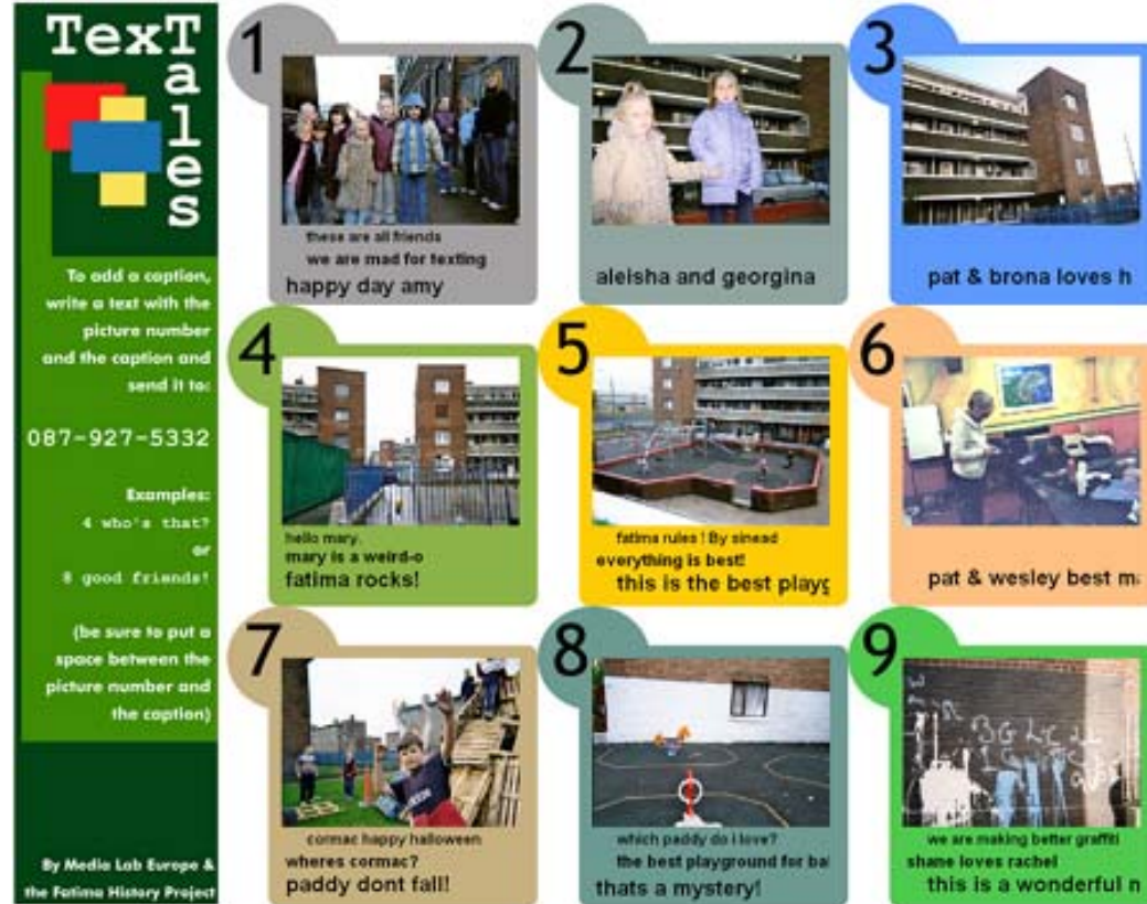
Table 4. All Texts Sent to Image Set D over 3 nights of installation, sorted by photo number. Image-text combinations for photos 1, 2 and 4 are highlighted and analysed below in more detail.