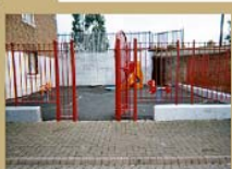
red fence 2 anywhere cooper and gavin : best mates my ( chantelle friends