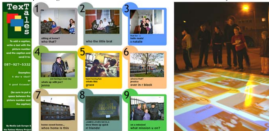
Figure 1. Left: The TexTales interface with 9 images and, for each image, the three most recently sent SMS text captions. Right: a TexTales installation in Dublin's Fatima Mansions community.

Here we present one system, TexTales [3], created to support and investigate authorship at varying scales and in everyday spaces that become new forums for public discourse. TexTales is a large-scale photographic installation to which people can send SMS text captions from mobile phones. We review one community's experiences designing a TexTales installation. Analysis of the resulting archive reveals novel personal expressions, broad communications trends and implications for new means of forming and polling public opinions.