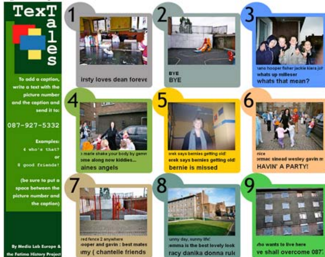
Table 2. All texts sent to Image Set B over 3 nights of installation, sorted by photo number. Image-text combinations for photos 2, 5 and 7 are highlighted and analysed below in more detail.